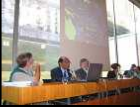
Pacific Centre for Environment and Sustainable development (PACE-SD)