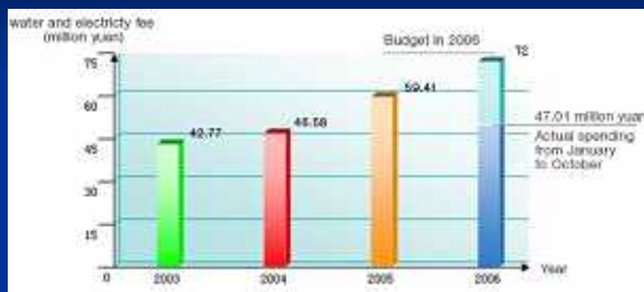
Figure 2 Water and Electricity Fee of Tongji University